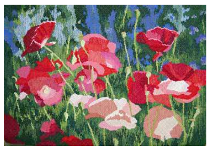
Tapestry Weaving: The Next Steps with Joanne Hall

Skill Level : Some tapestry experience is helpful