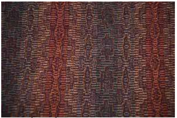
Shadow Weave in Polychrome

with Sarah Fortin Skill Level : All levels. Must be able to read a draft and dress a 4 or 8 shaft loom.